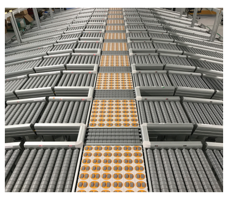
Multiple OTU for 20+ sort stations.

"There is not a motorized driven roller conveyor system quite like this one. The OTU (Omnidirectional Transfer Unit) allows for complex sortation and diverting capabilities to maximize throughput. Additionally, the integrated safety controls make this one of the safest conveyor systems on the market today."